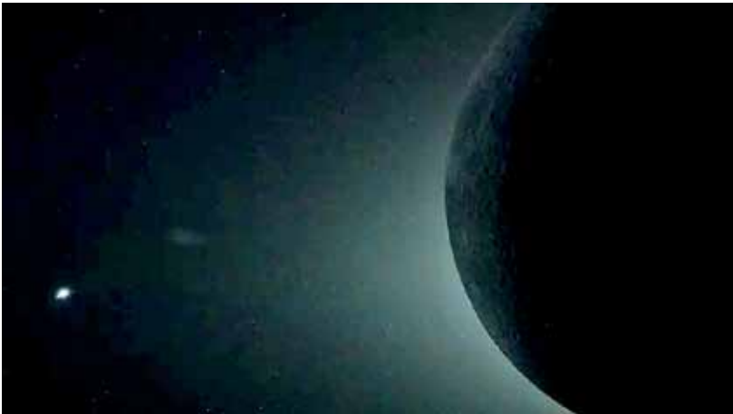
During the fly-by the astronauts saw an eclipse – where the Sun's light was blocked out behind the Moon, with only a tiny bit of light visible around the edges.