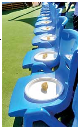
Donuts ready for the race.

At the end, even if you win in everything or lose in everything, everyone participating without a doubt gets a present. So don’t worry if you are bad at sports or activities, because you will always get a gift.