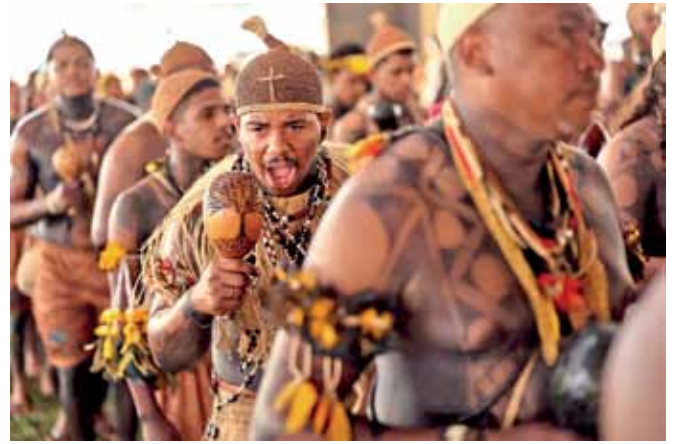
Brasilia, Brazil Indigenous people attending the Acampamento Terra Livre (Free Land) Camp, take part in a protest titled "Congress, enemy of the people: our future is not for sale" as they demand the demarcation of Indigenous lands and constitutional and cultural rights, in Brazil.