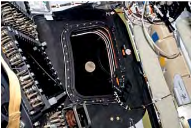
Outer Space A view of the Moon taken by an Artemis II crew member through a window of the Orion spacecraft on day five of the mission.