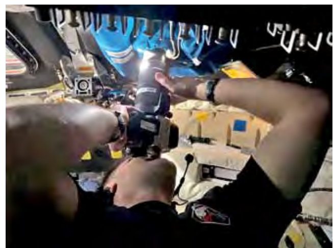
This picture shows astronaut Jeremy Hansen taking pictures during the fly-by using a special camera shroud – which is a special curtain with a hole for the camera lens to pass through – it is used to help prevent light from the cabin from reflecting on the windowpanes and spoiling the pictures.