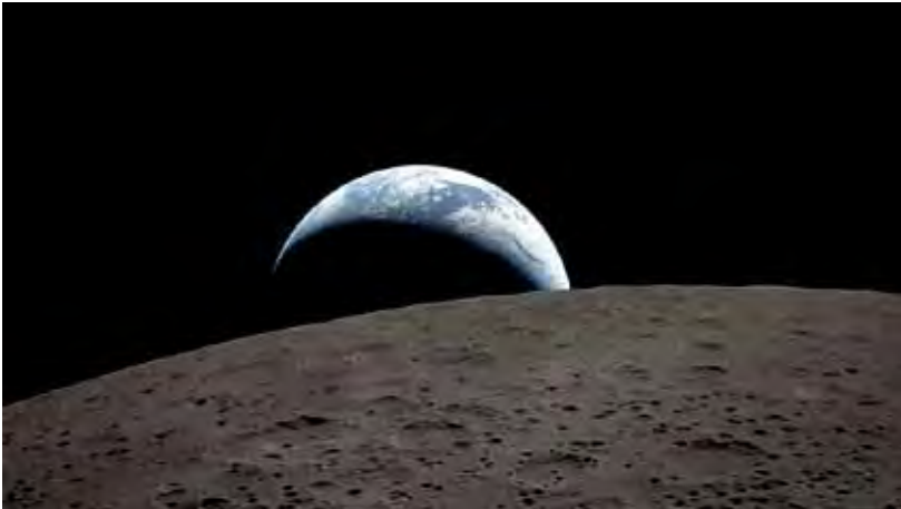
You might have seen a sunset before, but how about an Earthset? This picture of Earth peeking out from behind the Moon was taken three minutes before the Orion spacecraft and its crew went behind the Moon and lost contact with Earth for 40 minutes before emerging on the other side.

Here are the pictures the astronauts took on their journey behind the Moon.