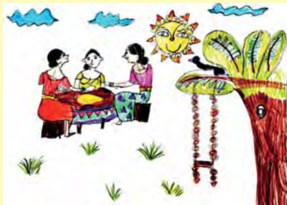
Netana Krause (7 years) Ladies' College, Colombo