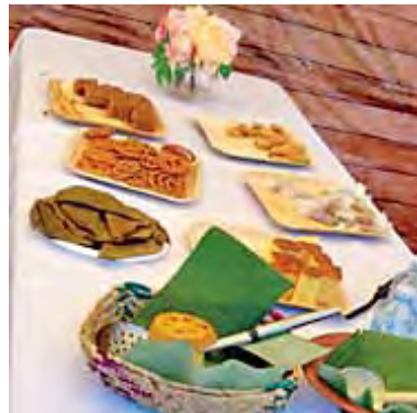
Sinhala Avurudu table.

Next were traditional Avurudu Games. The game we first participated in was ‘donut eating’.