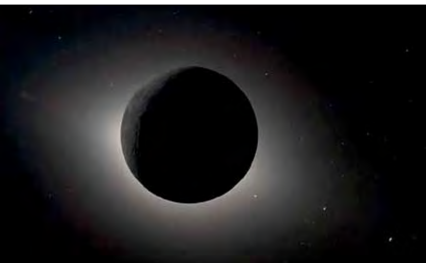
This picture shows the Moon fully eclipsing the Sun. The Sun's outer atmosphere can be seen peeking out from behind the Moon. Stars that are usually too faint to be visible, because the reflected light from the Moon is so bright, are seen in the image – because the Moon is in shadow.