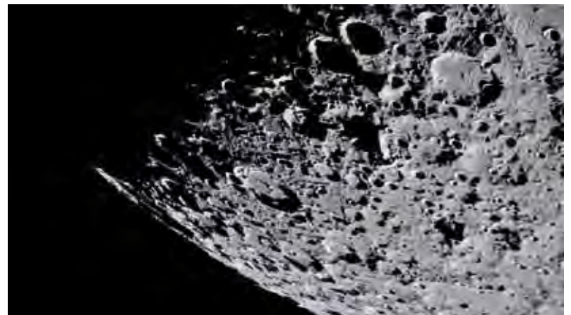
This picture shows the South Pole-Aitken basin – the largest and oldest basin on the Moon – believed to have formed billions of years ago. Roughly 2,500 km across it is one of the largest known impact craters in the Solar System.