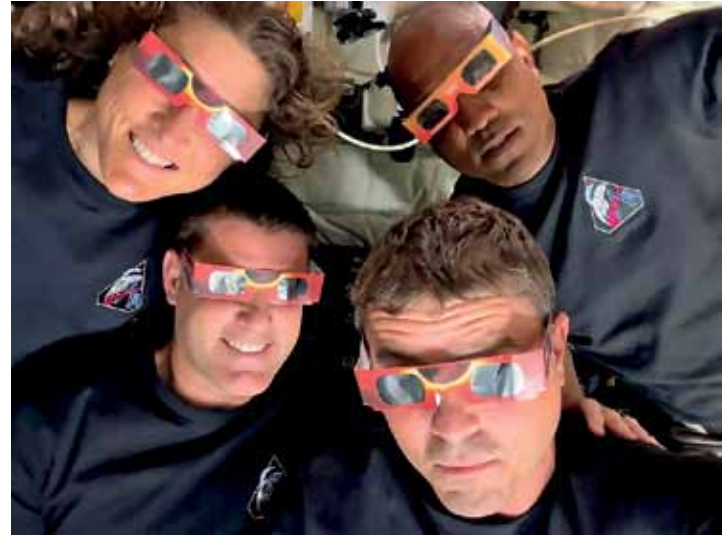
The Artemis II crew wore special eclipse glasses to protect their eyes during the solar eclipse.