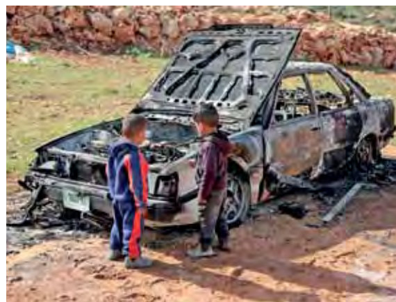
Al-Luban e-Sharkiya, Palestinian Territories Palestinian children inspect a destroyed car, which Palestinians say was burned by Israeli settlers, in Al-Luban e-Sharkiya, near Nablus, in the Israeli-occupied West Bank.