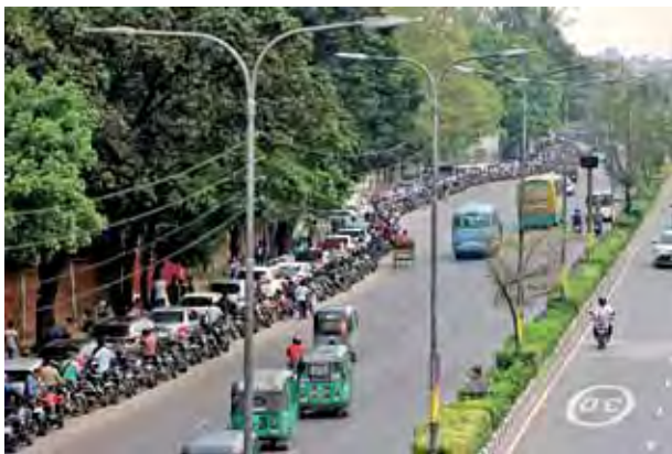
Dhaka, Bangladesh Vehicles wait in a long line to refuel at a gas station in Dhaka.