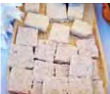
Some Avurudu sweetmeats.