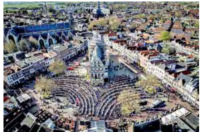
Gouda, the Netherlands Every Easter Monday the city of Gouda hosts a free breakfast in the historic city centre.