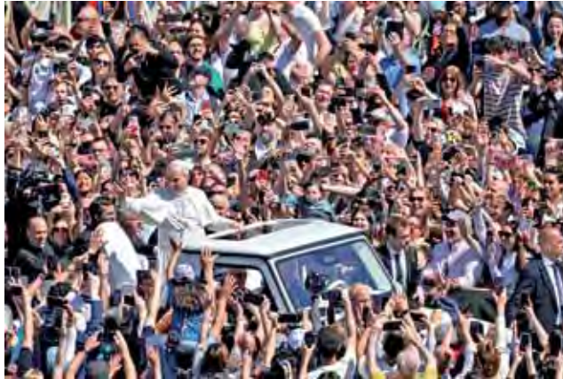
Vatican City, Vatican Pope Leo XIV greets the faithful from the pope-mobile after delivering his Urbi et Orbi (to the city and the world) message, in St. Peter's Square at the Vatican.