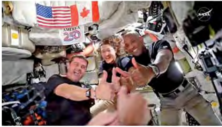
Space A screengrab from a NASA livestream of Artemis II crew members Reid Wiseman, Christina Koch and Victor Glover giving a thumbs up onboard the Orion spacecraft.