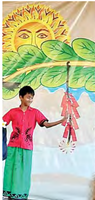
I am wearing a Sri Lankan traditional costume.

The sack race was a very fun and engaging activity where we jumped in sacks, waist deep and jumped across a field until we reached the end. It was a very competitive sport.