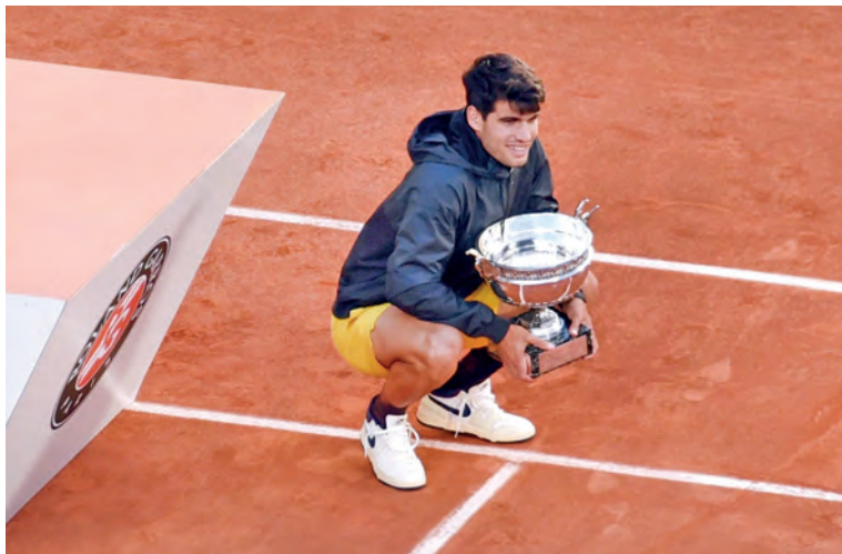
Alcaraz with his French Open trophy in 2024.

Two French Open titles, two Wimbledon titles and a second US Open followed, showing his skill on all surfaces — hard court, grass and clay. This latest win firmly establishes Alcaraz as one of the world's most accomplished tennis players — and he is just getting started!