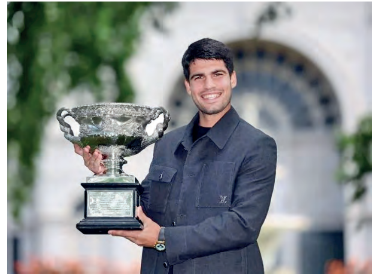
Carlos Alcaraz is the youngest male player to complete a Career Grand Slam.

After the match, Alcaraz signed the broadcast camera with a simple message: "Job finished. 4/4 complete."