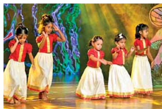
Kiddie Cove Annual Graduation and Concert 2025 was held on December 6, at the Buddhist Cultural Centre in Colombo.