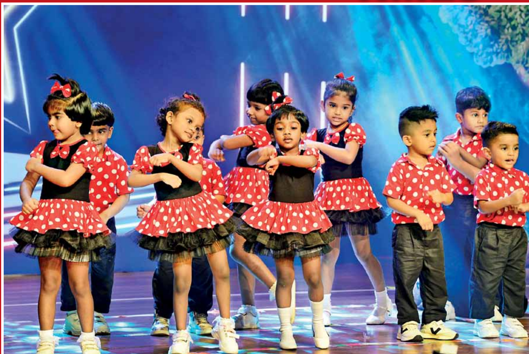
Polka Dots on Stage