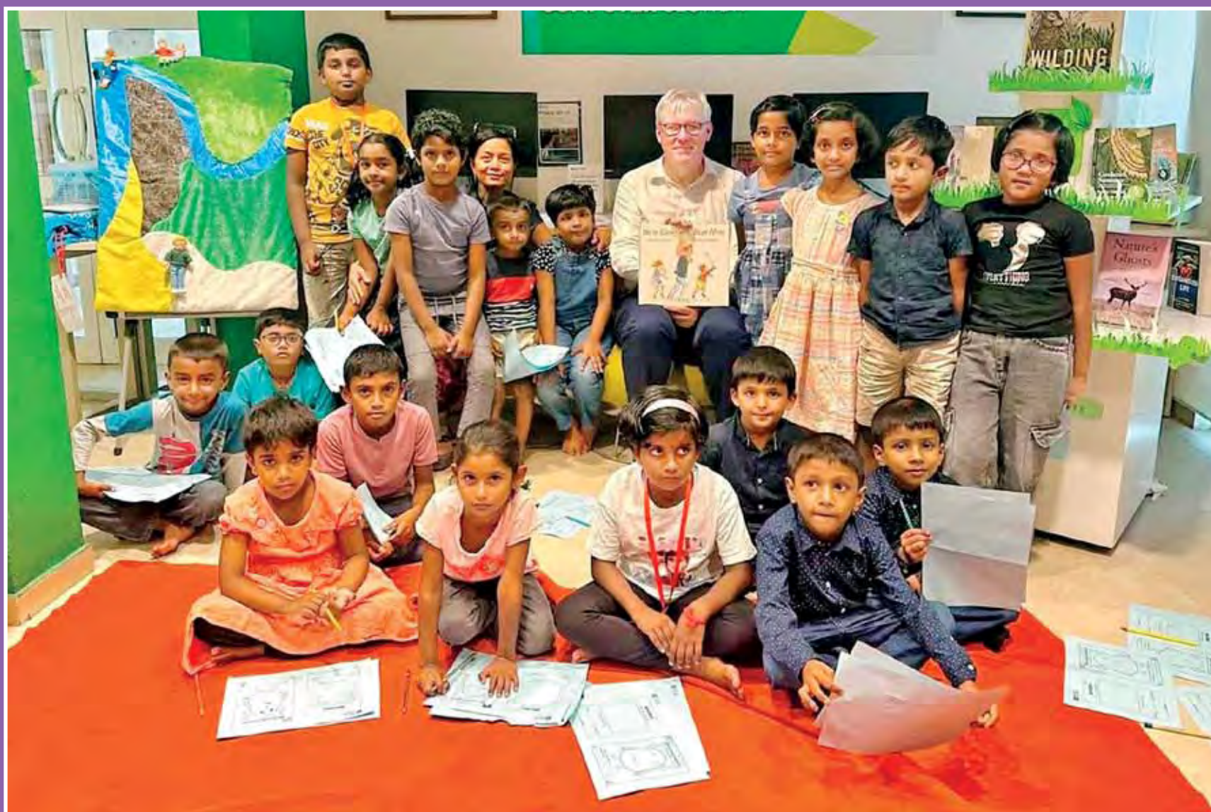
Storytelling in Jaffna