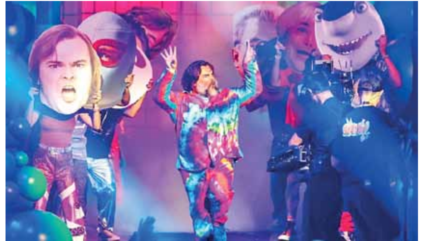
Jack Black was crowned King of Comedy.

Favourite Movie Actress went to 'Wicked's' Ariana Grande, while the song 'Defying Gravity' won Favourite Song from a Movie.