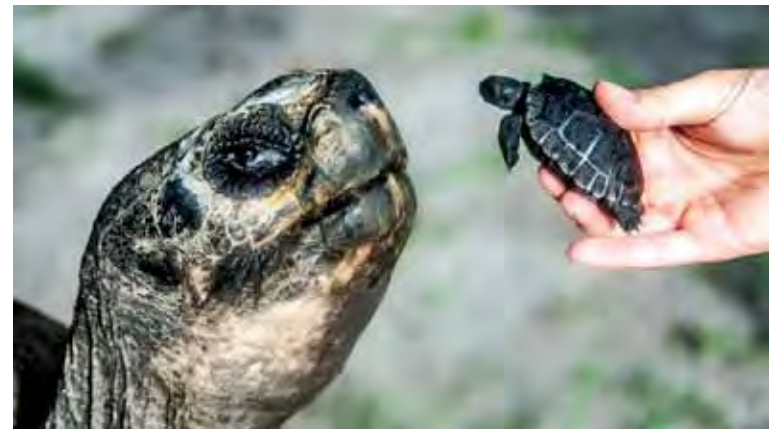
Goliath has become a father for the very first time at 135!

The new tortoise's mother, called Sweet Pea,