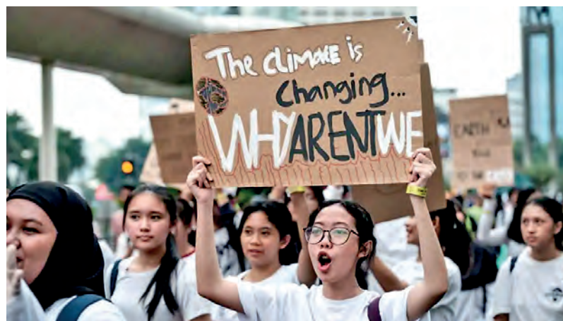
The organisers are encouraging people to express their views to raise awareness.

The theme for Earth Day 2025 is 'Our power, Our planet', which focuses on renewable energy.