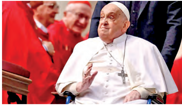
Pope Francis made appearances during Holy Week and Easter weekend.

US President Donald Trump posted a message on social media saying, "Rest in Peace Pope Francis! May God Bless him and all who loved him!"