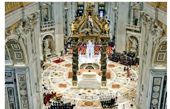
After the funeral people will be able to pay their respects in St Peter's Basilica.

After the Pope's funeral, Pope Francis' body will be placed in an open coffin in St. Peter's Basilica in the Vatican City for members of the public to pay their respects for several days.