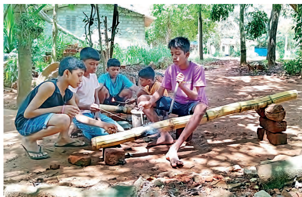
Young kids making and lighting 'Bamboo Cannon' fireworks to herald Avurudu in Saliyawewa.