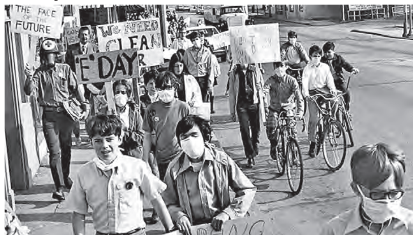
Earth Day started in the US in 1970.

Earth Day is a global movement which happens every year on 22 April.