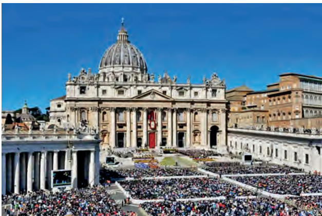
At Easter thousands of Catholics gather at St Peter's Basilica in the Vatican.

If the smoke is black, no Pope has been elected, but if the smoke is white a new Pope has been chosen.