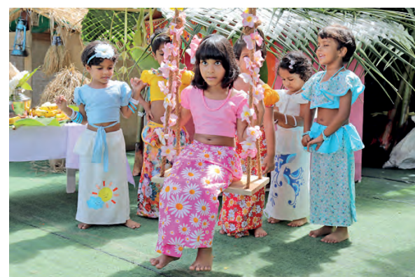
Sinhala and Tamil New Year traditions were celebrated at Maple Kids International along with fun Avurudu games.