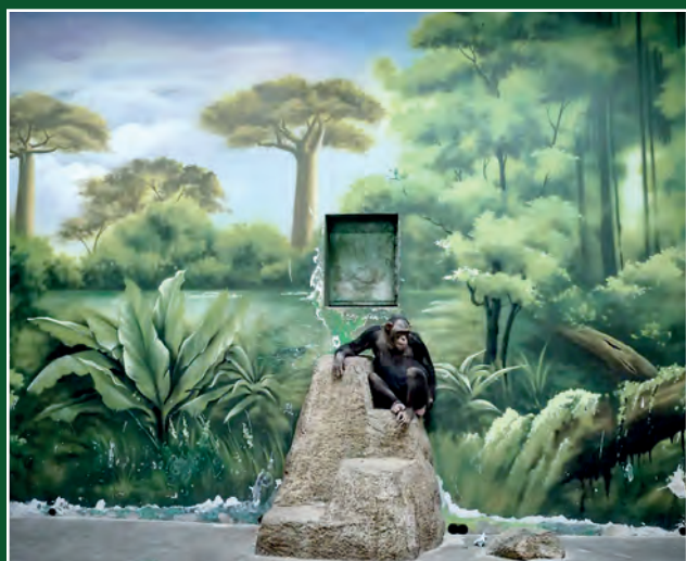
Photographer of the Year winner Zed Nelson took this photo of a chimpanzee in front of a painted background.