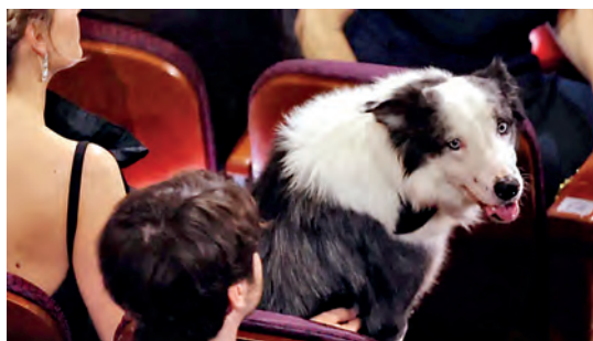
One of these guests is not like the others...

The Oscars audience was joined by a four-legged star this year: Messi the dog.