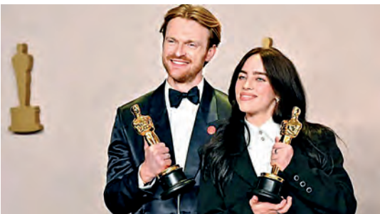
Billie and her brother Finneas are Oscars record-breakers!

But 'I'm Just Ken' wasn't the 'Barbie' movie's big winner at the awards show, it also won Best Original Song for 'What Was I Made For?' by Billie Eilish and her brother Finneas.