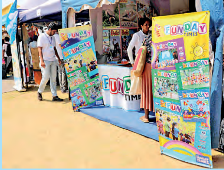
The Sunday Times / Funday Times Stall