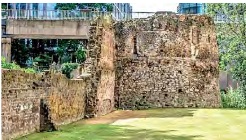
London's history can be traced back thousands of years to Roman times - this picture shows part of a Roman fort in London dating back to AD 120.

But they did not know how far the settlement reached, until now.