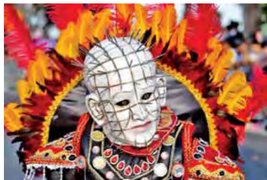
Santo Domingo, Dominican Republic A troupe member participates in the National District Carnival.