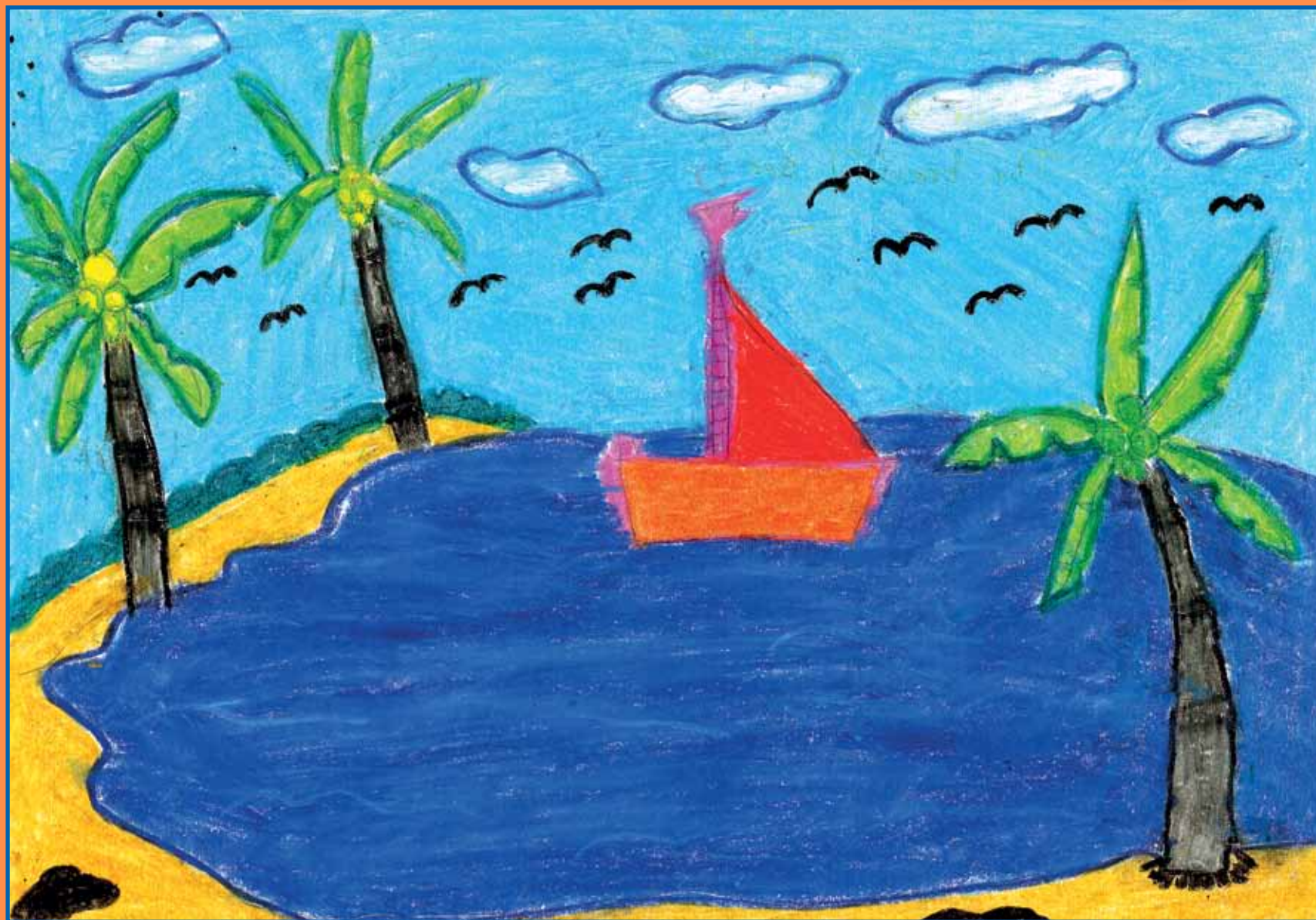
The beautiful sea