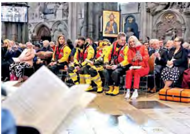
London, UK Members of the Royal National Lifeboat Institution await the start of a service of thanksgiving to mark the 200 th anniversary of the RNLI at Westminster Abbey.