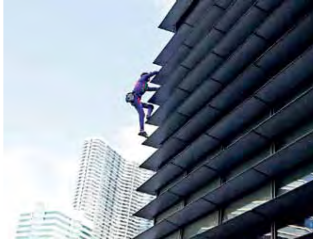
Manila, Philippines French urban climber Alain Robert, known as the French Spider-Man, climbs the GT Capital building. Robert climbed the 47 floors of the building. The police later arrested him.