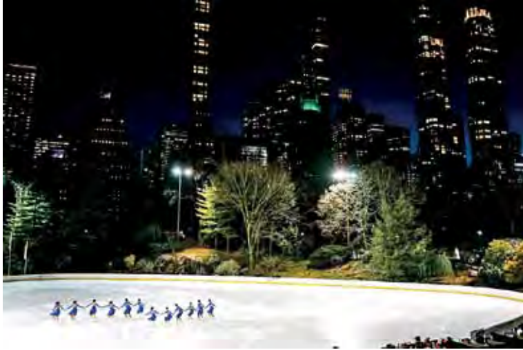
New York, USA Members of Figure Skating in Harlem perform at the Central Park rink for a gala show.