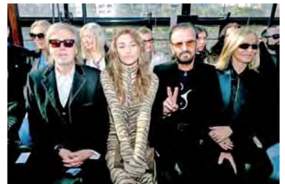
Paris, France From left: Sir Paul McCartney, Paris Jackson, Sir Ringo Starr and Barbara Bach attend a Stella McCartney show at Paris Fashion Week.