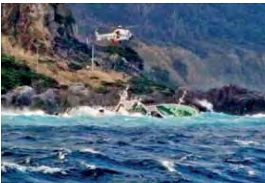
Kozushima Island, Japan A helicopter conducts a rescue operation after a ship lost power and drifted onto rocks in rough seas. Twenty-four people were rescued and one person remains missing.