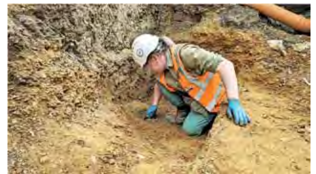
The Archaeology South-East team from University College London continued excavations near the gallery.