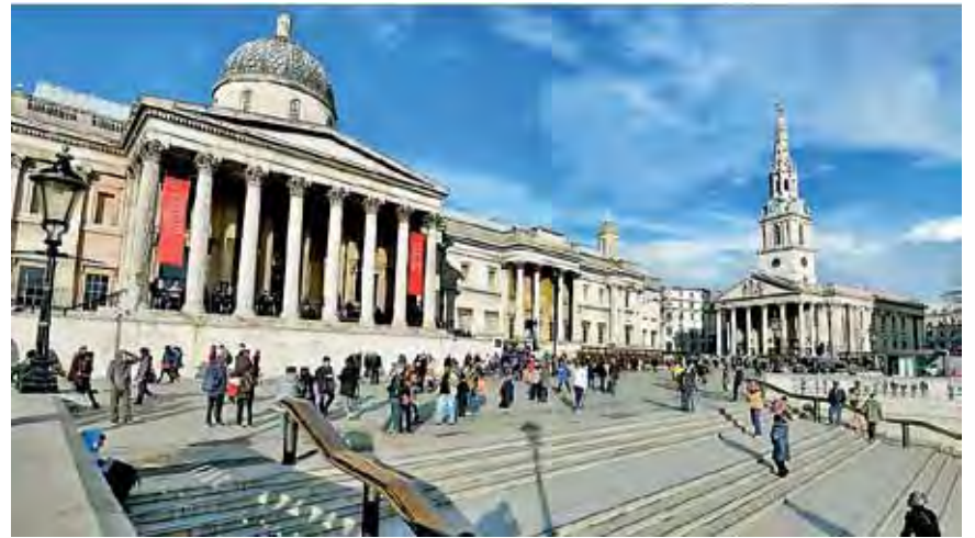
The National Gallery is a famous art gallery in London.

London students were also given the opportunity to witness the archaeological dig in progress.