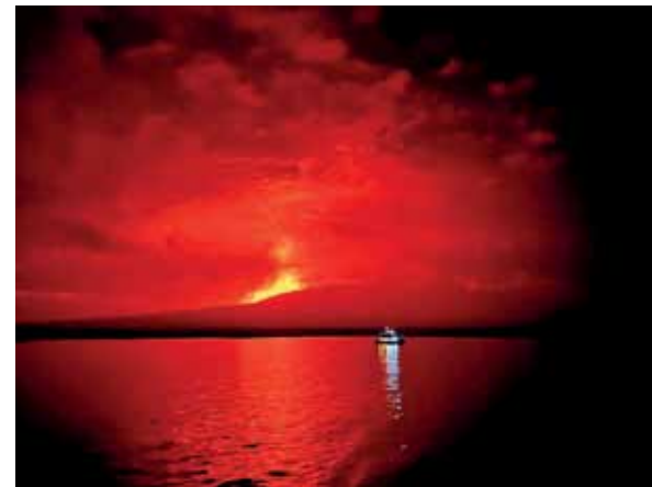
Galápagos Islands, Ecuador La Cumbre volcano erupts on Fernandina Island.