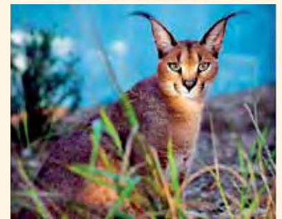
National Geographic Kids