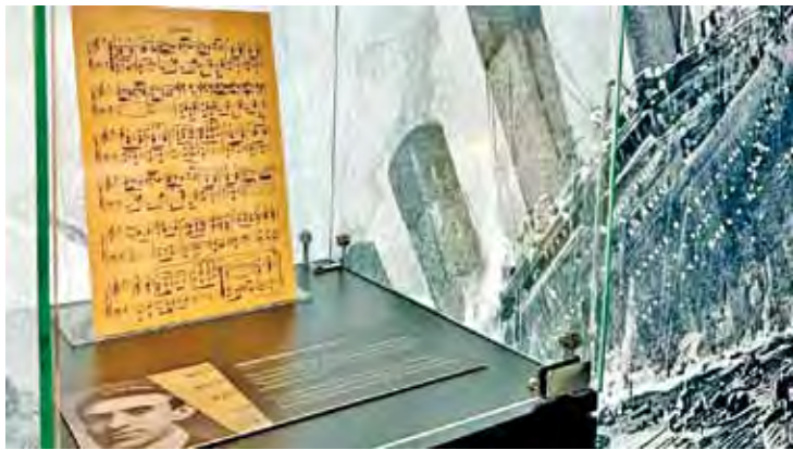
Sheet music found with the body of a musician who was part of the ship’s band is also a part of the collection.

The exhibition also showcases a foghorn used during the rescues.