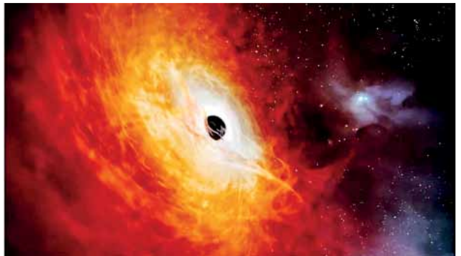
The bright core of J0529-4351 is powered by a supermassive black hole, as shown by this artist’s impression.

The Australian-led team worked on observations of the quasar, known as J0529-4351, captured by the Very Large Telescope in Chile.