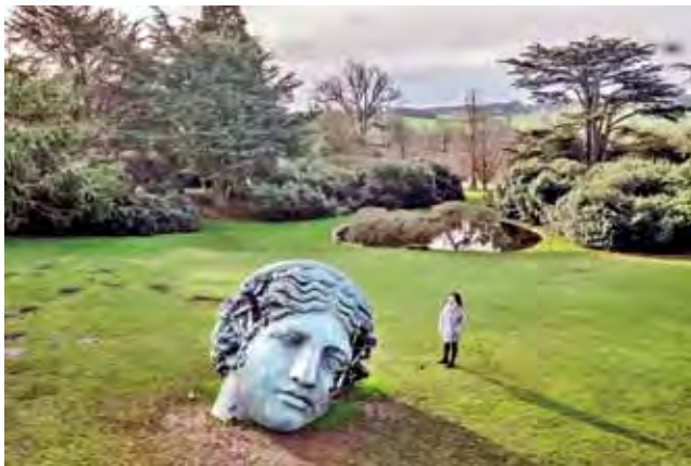
Wakefield, UK Daniel Arsham's 'Unearthed Bronze Eroded Melpomene' is installed for his 'Relics in the Landscape' exhibition at the Yorkshire Sculpture Park.