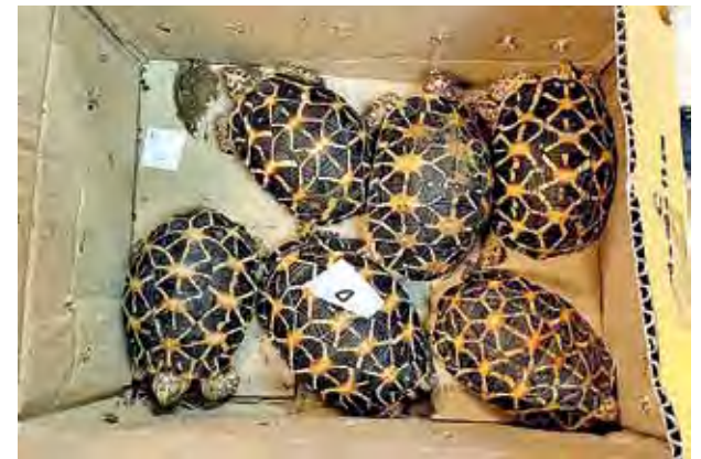
Bangkok, Thailand Star tortoises sit in a box at Suvarnabhumi airport after being found in the luggage of a man attempting to travel to Mongolia. The man was arrested for allegedly trying to smuggle komodo dragons, pythons, tortoises and 24 live fish, out of the country.