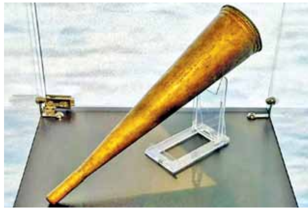
A foghorn that was used during the rescue operations after the Titanic sank has been put on display.