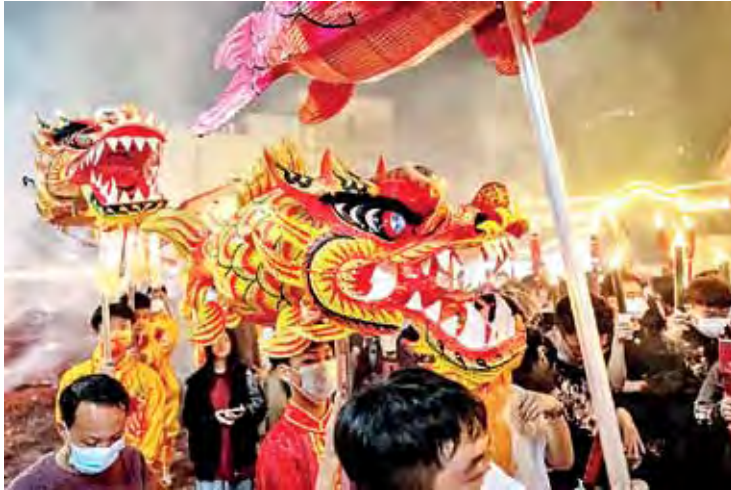
Jieyang, China Villagers raise dragons for the Torch Festival, which has been held for more than 300 years, during Lunar New Year.