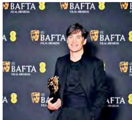
Cillian Murphy poses with his award for Best Leading Actor for his role in 'Oppenheimer'.