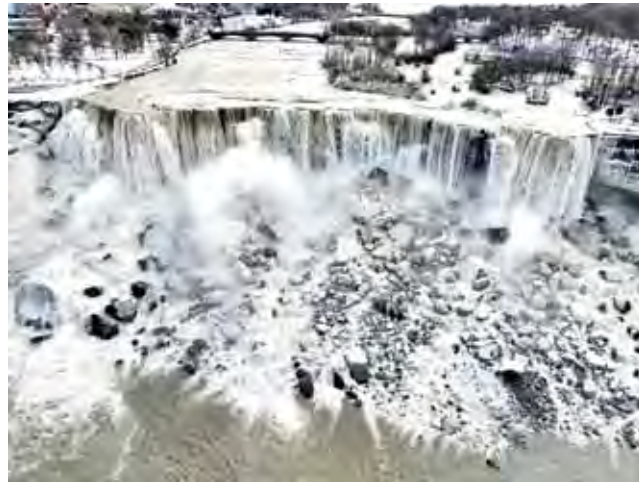
Niagara Falls, USA The Falls in New York state partly freeze after a winter storm hit much of the Midwest and northern US.