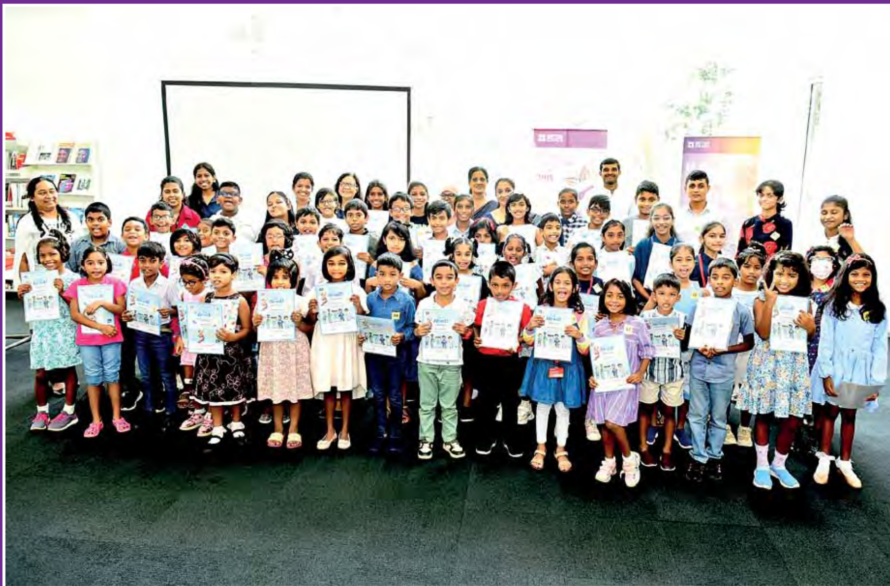
BC Reading Challenge Awards