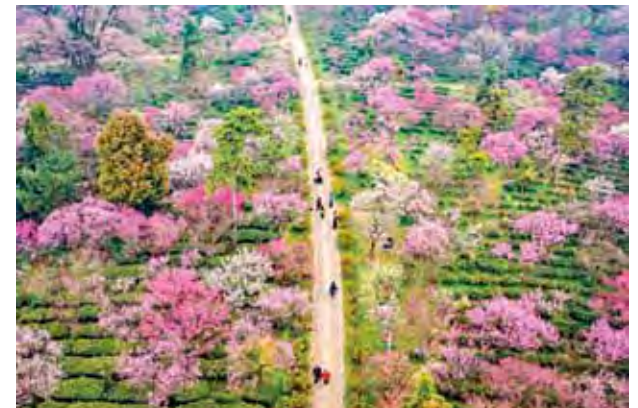
Nanjing, China People enjoy the sight of plum blossom trees in flower in the country's eastern Jiangsu province.