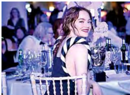
Emma Stone, at the BAFTA dinner, with her award for Best Leading Actress for 'Poor Things.'

The British Academy Film and Television Arts Awards (BAFTA) ceremony was held at the Royal Festival Hall in London.