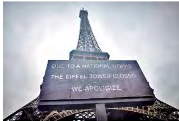
Paris, France A notice informs visitors that the Eiffel Tower is closed as staff go on strike. The CGT and Force Ouvrière unions say the city, which owns 99% of the tower, has underestimated its costs and overestimated its revenues.