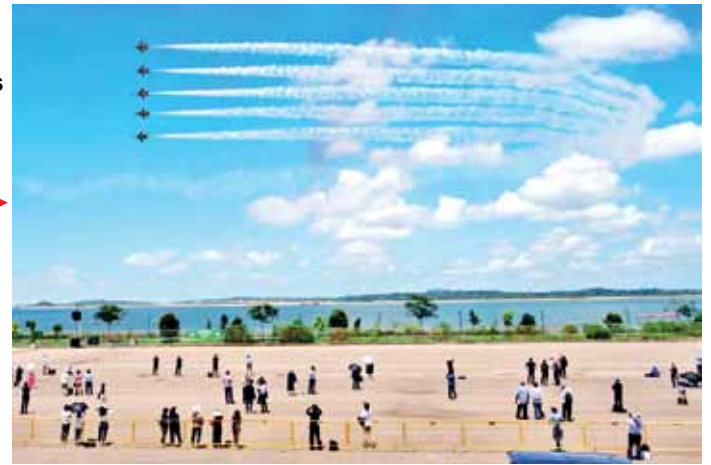
Singapore The South Korean Air Force's Black Eagles aerobatic team performs during the first day of the Singapore Air-Show.