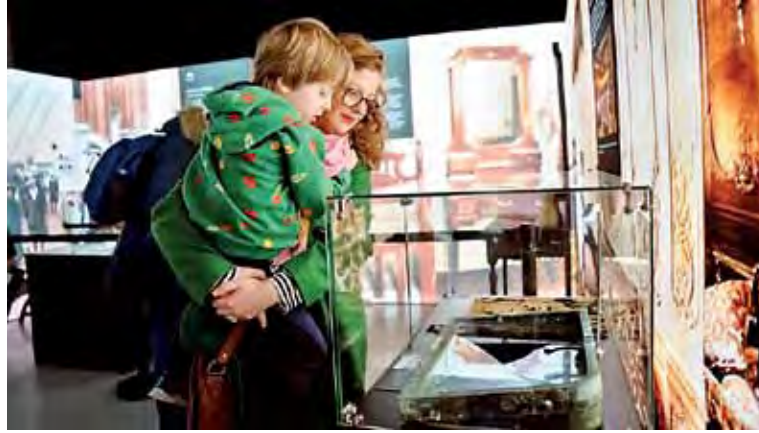
The items in the exhibition were collected and preserved by White Star Heritage.

The RMS Titanic sank in April 1912 after it struck an iceberg on its first voyage from Southampton to New York.