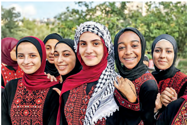
Gaza Palestinian girls at a picnic during the olive harvest season.