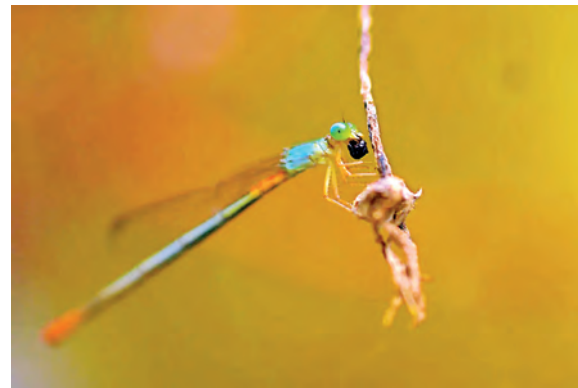
Nagaon, India A damselfly in a garden in the north-eastern state of Assam.