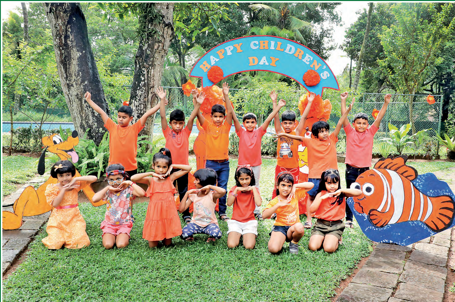
Celebrating Children's Day