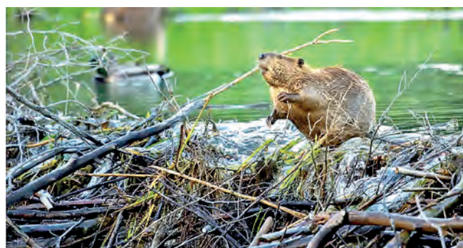
Beavers build dams which are made up of wood from trees