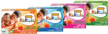
Kekulu Baby Soap