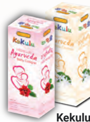
Kekulu Baby Cologne