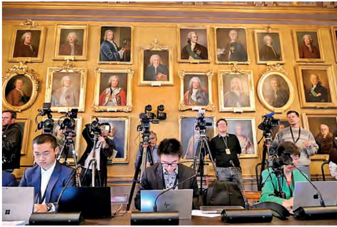
Stockholm, Sweden Journalists wait for the announcement of the winners of the 2023 Nobel prize in physics, at the Royal Swedish Academy of Sciences. The prize was jointly awarded to Pierre Agostini, Ferenc Krausz and Anne L’Huillier for ‘experimental methods that generate attosecond pulses of light for the study of electron dynamics in matter’, the academy announced.