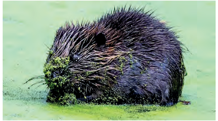
The baby beaver was caught on camera over the summer

Another benefit to the beavers' dams is the large wetlands that are created as a result, and this environment is very beneficial to the wildlife and plants that live there.