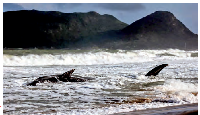
Florianópolis, Brazil A stranded sperm whale is seen on Morro das Pedras beach.