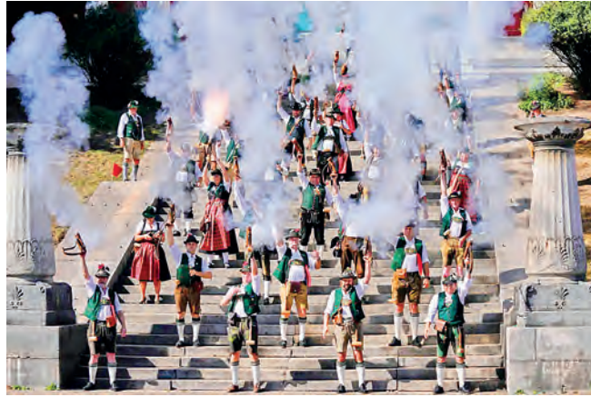
Munich, Germany Bavarians in traditional costumes fire their muzzle loaders on the last day of the Oktoberfest beer festival.