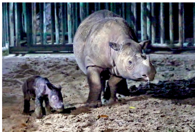
Lampung, Indonesia An endangered female Sumatran rhinoceros, recently born at the Sumatran Rhino Sanctuary of Kambas national park, seen next to her mother, Ratu.