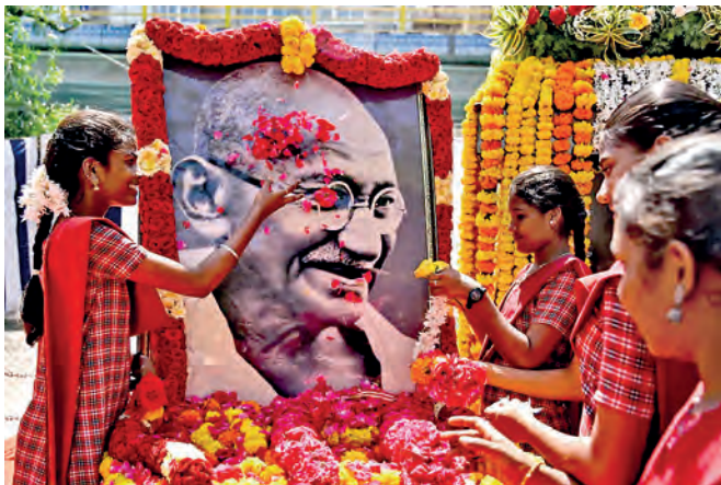
Chennai, India School students pay a floral tribute to Mahatma Gandhi to mark his 154 th birth anniversary on the occasion of Gandhi Jayanti.