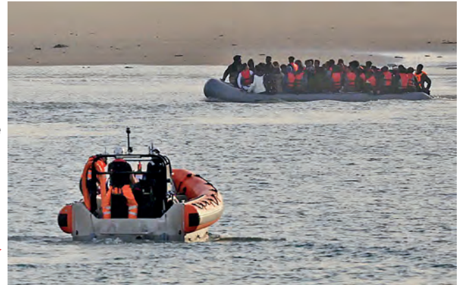
Le Portel, France Crew members of the French rescue vessel Abeille Normandie look after a group of people on an inflatable dinghy sailing back to the beach after their unsuccessful attempt to cross the Channel from the coast of northern France.