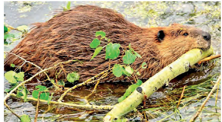
Beavers are known for their roles as engineers