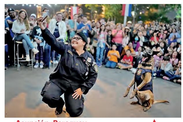
Asunción, Paraguay A police dog instructor poses for a selfie with her dog during a display.