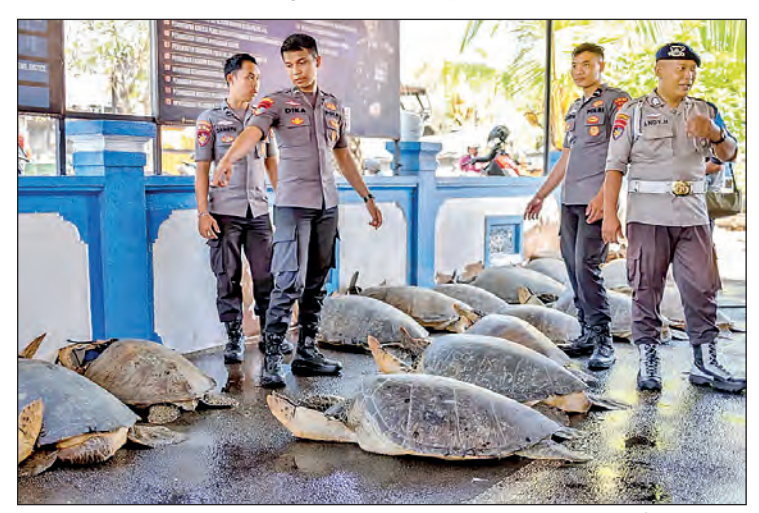
Indonesian marine police load sea turtles into a truck after they were seized from an illegal poacher in Denpassar, Bali. A total of 21 green turtles have reportedly been seized from the illegal poachers. Although protected by law, sea turtles and their parts are still frequently traded in many places in Indonesia.