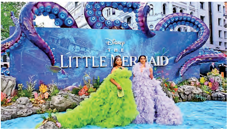
Rappers Stefflon Don and Shemara posed by the amazing red carpet designs in their epic outfits.