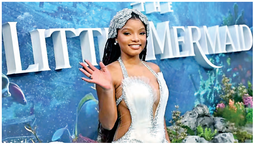
Halle plays Princess Ariel in the Disney Little Mermaid live-action remake.