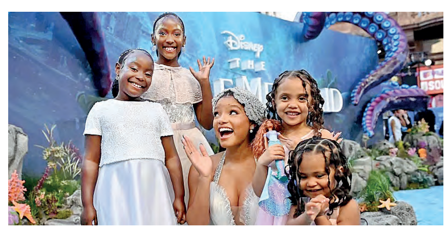
Some lucky fans were able to attend the premiere and even got to meet Halle.

The film follows the story of Ariel - the mermaid with a beautiful voice who gives up her life in the sea to be with a prince - and is a live-action version inspired by the 1989 animated musical film.