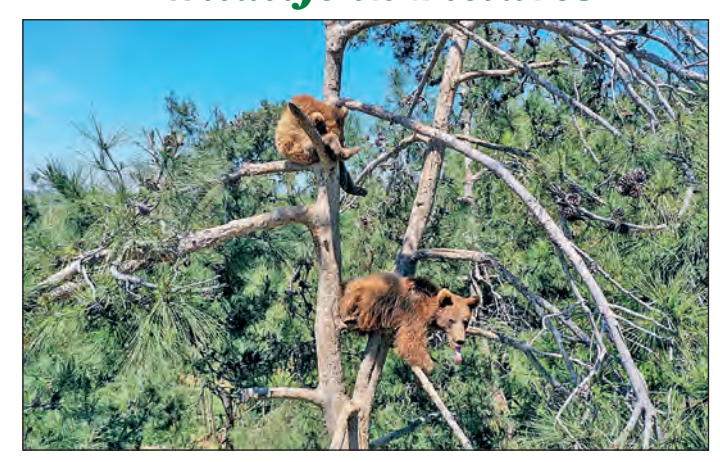
Bears, waking up from hibernation, at a bear sanctuary in Bursa, Turkey. Around 71 brown bears, 63 of them adult, live in the sanctuary which was opened in 1996.