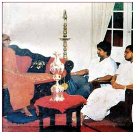
Mahanayakes shown the World Cup trophy: March 24, 1996