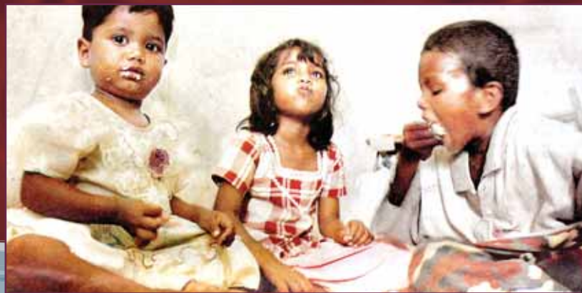
Tsunami children of the East: Jan. 2, 2005

At the start, most of our photojournalists took pictures on normal cameras and we had to go to colour labs to develop the pictures. This was a long process. But today with digital cameras, it is almost instant photography and within minutes some major event is on the page.