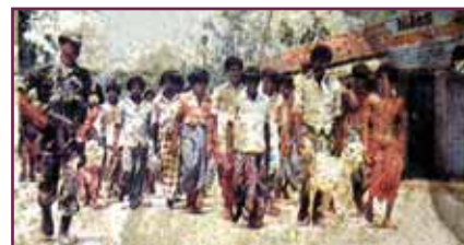
LTTE suspects in military custody: June 7, 1987