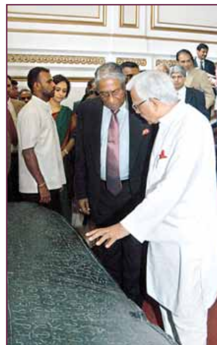
Foreign Minister Lakshman Kadirgamar with Indian External Affairs Minister Natwar Singh: June 10, 2005