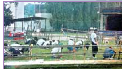
Town Hall bomb blast in which President Kumaratunga was injured in the eye: December 18, 1999