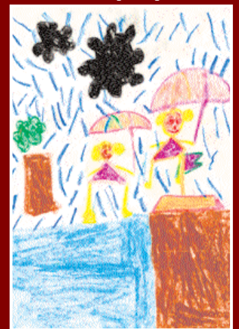
Tharushi Kasturige (UKG) Ceylenco Sussex College, Galle