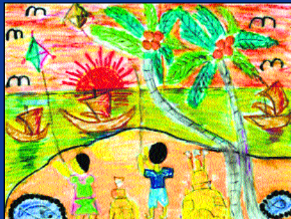
Nipuni Vithanachchlegge (8 years) Sacred Heart Convent, Galle