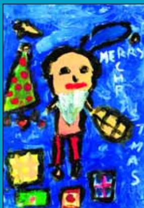
Amavi Kuruppu (5 years) Rainbow Kids Montessori, Galle