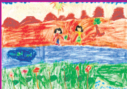
Venessa Ranathunga Kinderworld Nursery, Moratuwa