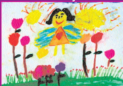
Shalom Shanmugalingam (4+ years) Ladies College Nursery