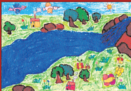
Ayushki Pathiraja (6 years) Kiddles Castle, Kurunegala