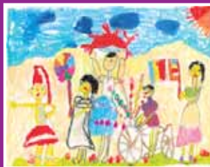
Chanudi Gajadeera Methodist College, Colombo