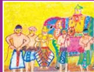
Ravindu Dias Royal College, Colombo