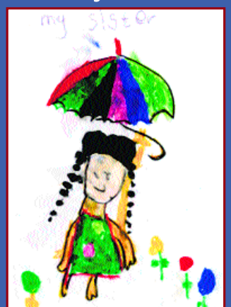
Kavindi Sugathadasa (4 years)