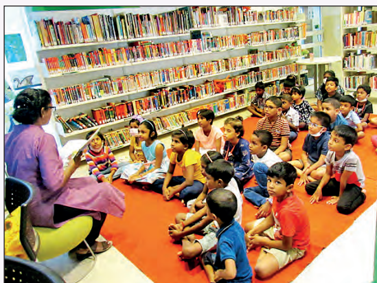
Storytelling session at British Council Jaffna