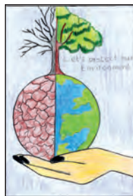
Osanda Vihansa (Grade 4) G/Dharmashoka College, Ambalangoda

Some people cut down trees, throw polythene, use chemicals and they destroy the environment. The environment is our home. Therefore we must protect our environment for the future generations.