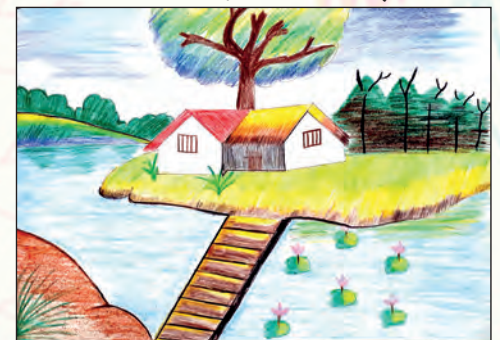
Shreenithi Nagarathnam (Grade 7) Belvoir College Int.