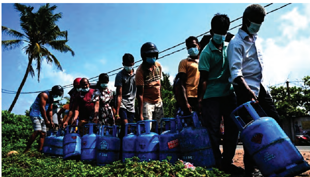
There have been long queues for liquid petroleum gas as the amount of fuel available drops.

This has led to shortages, very high prices and power cuts for several hours a day.