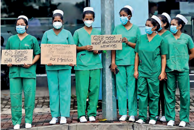
Colombo, Sri Lanka Doctors and nurses of the Lady Ridgeway children's hospital stage a silent protest over medicine shortages.