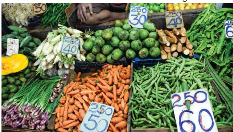
The cost of living has skyrocketed in Sri Lanka.

Instead of dealing with the issues, governments including Mr. Rajapaksa’s continued to borrow money from countries like China, leaving Sri Lanka with billions of dollars of debt to pay back.