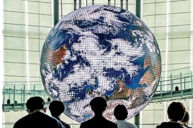
Tokyo, Japan Reporters look at the Geo-Cosmos, a spherical display made using organic electroluminescent panels showing a high-resolution image of the Earth, during a media preview at Miraiikan, the National Museum of Emerging Science and Innovation.