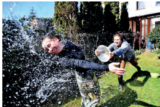
Szczecin, Poland Children throw water at each other on Wet Monday, as part of Easter celebrations.