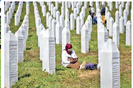
Srebrenica, Bosnia A woman reads a religious text at the memorial cemetery for victims of war crimes committed during Bosnia's 1992-95 war.