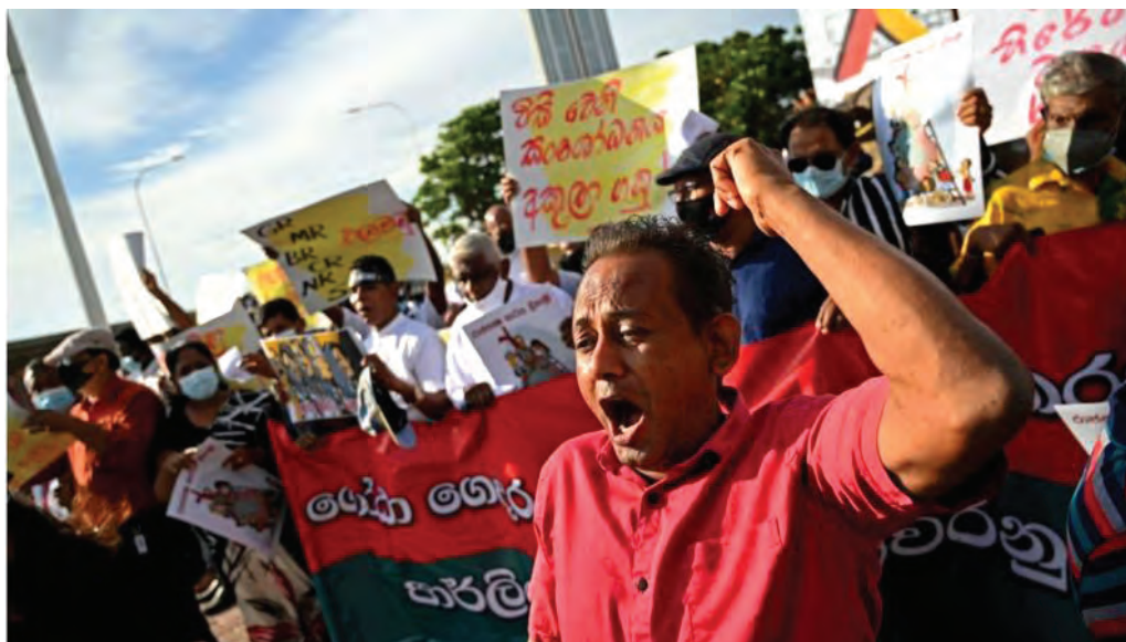
Sri Lankans took to the streets in early April

It means Sri Lanka cannot currently afford to pay for basic foods and fuel, which it buys and imports from other countries.