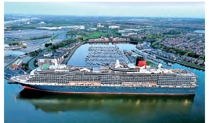
North Shields, England The MS Queen Victoria cruise ship operated by Cunard Line is moored at Royal Quays Marina after returning from Barbados.