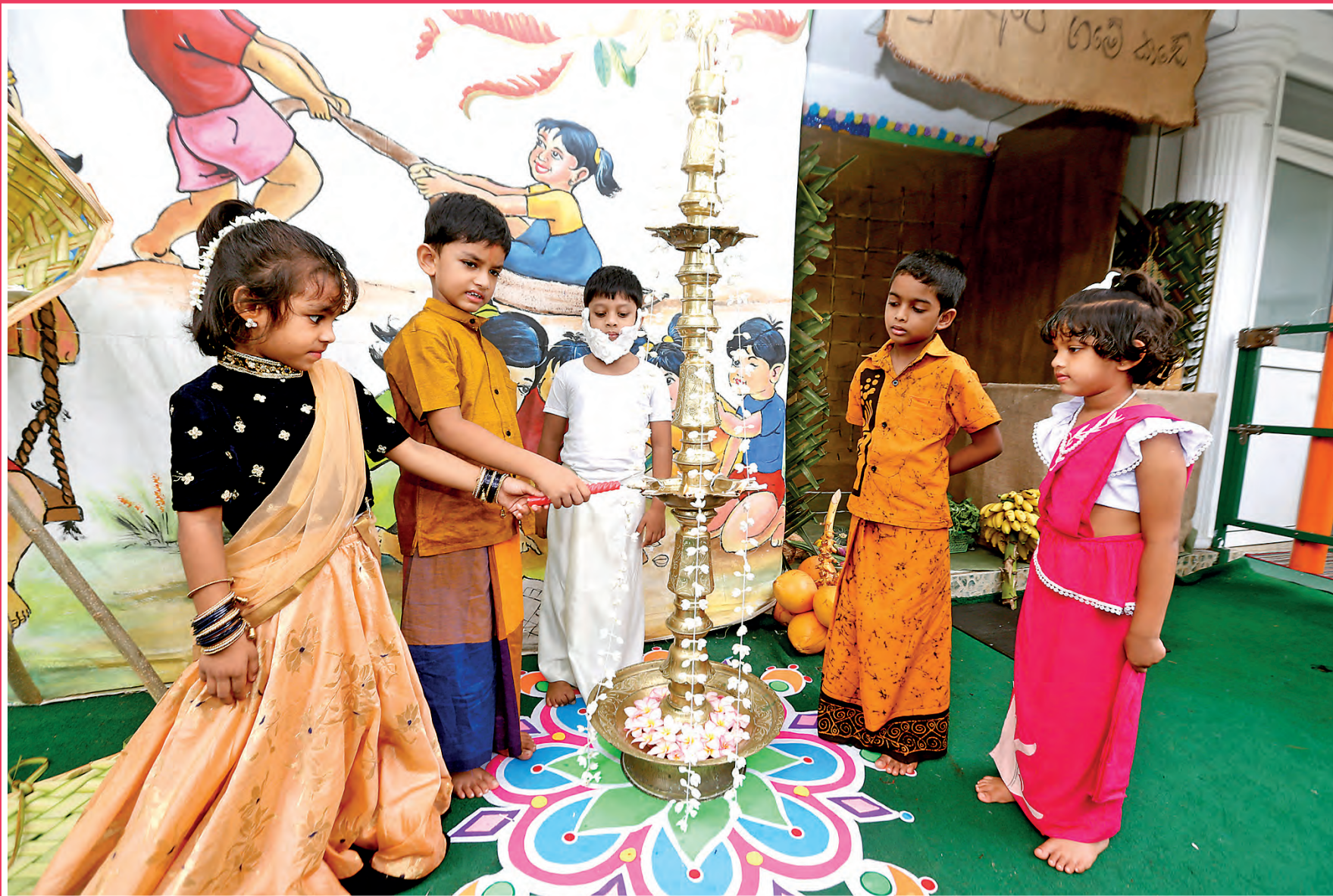
Lighting the traditional lamp in harmony