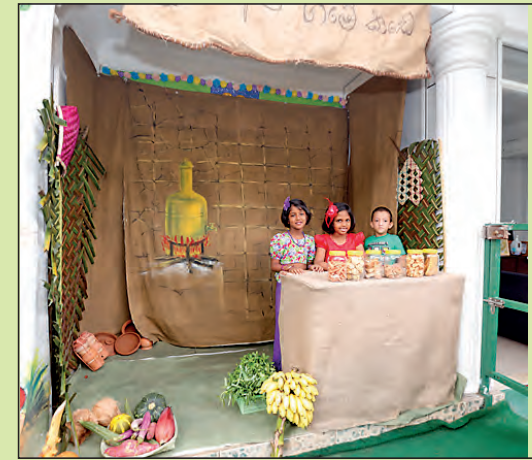
Avurudu celebrations at Immy Kids International, Nawala.