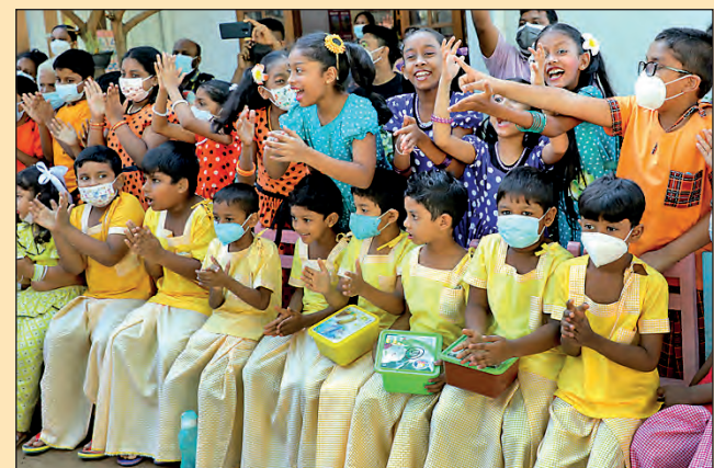
Vidura College, Kelaniya held their Avurudu Festival on April 7, 2022.