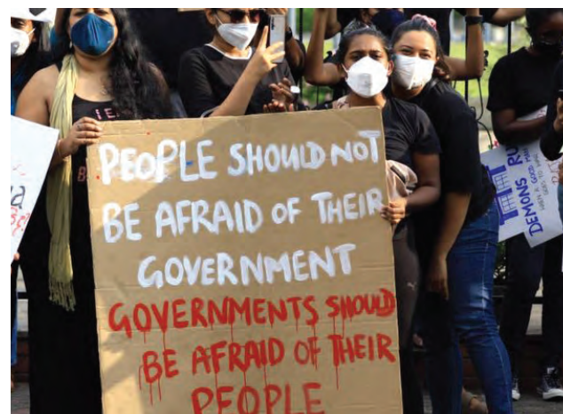
Sri Lankans shout slogans

money and has heavily relied on selling tea, clothing and tourism, as well as importing lots of goods from abroad.