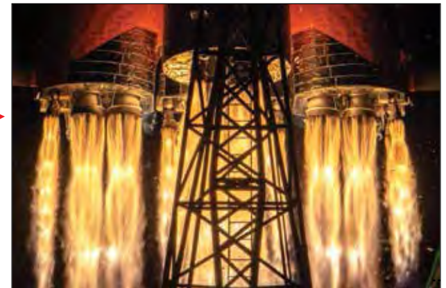
Kyzylorda region, Kazakhstan ▶ A Soyuz rocket booster carrying the Progress MS-17 cargo freighter blasts off from the Baikonur cosmodrome.