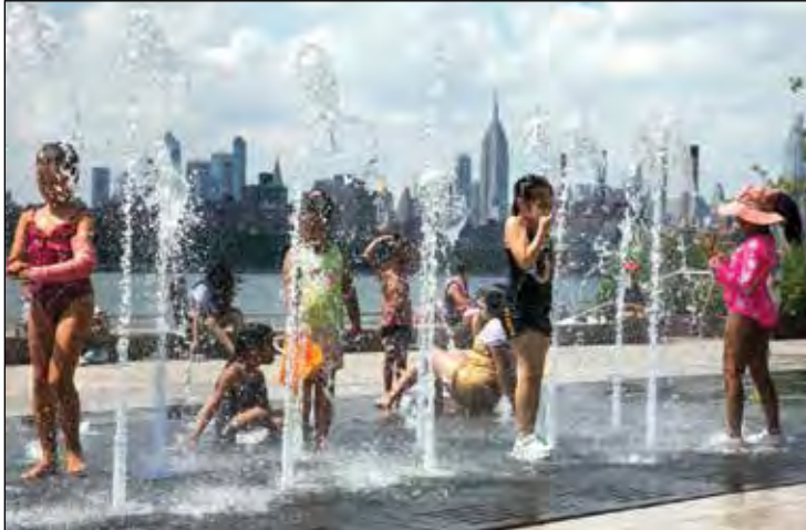
New York, USA ▲ Children cool off in a fountain during a record heatwave in Brooklyn.