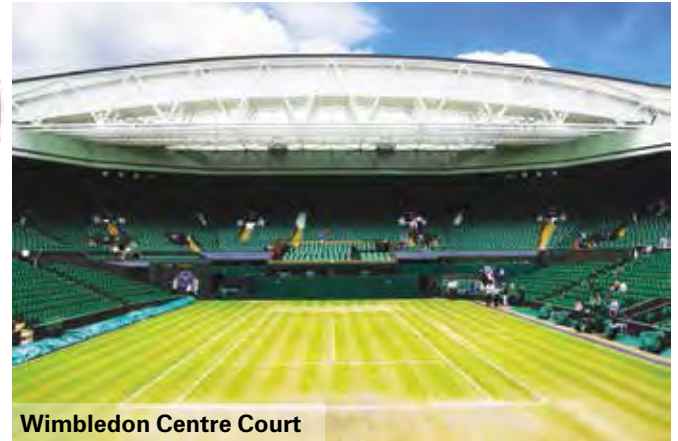
Wimbledon Centre Court