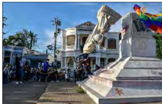
Barranquilla, Colombia ▲ Protesters topple a statue of Christopher Columbus during a demonstration against the government.