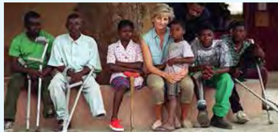
Diana visiting with injured children ▲

After attending schools in England and Switzerland, Lady Diana became a kindergarten teacher in London.