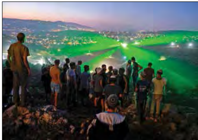
Eviatar, West Bank ▲ Israeli settlers and supporters in the newly established wildcat outpost of Eviatar watch as Palestinian protesters flash laser beams towards them from Beita village, near the northern Palestinian city of Nablus in the occupied West Bank. Jewish settlers agreed to leave the new outpost that has stirred weeks of Palestinian protests following a deal with Israel's government.