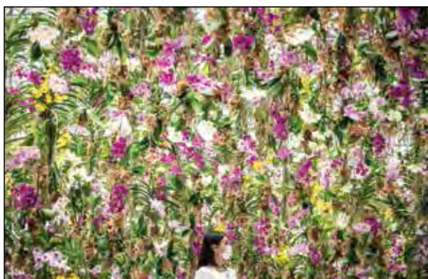
Tokyo, Japan ▲ A staff member stands in an interactive kinetic installation titled 'Floating Flower Garden: Flowers and I Are of the Same Root, the Garden and I Are One' at the TeamLab Planets garden area in the Toyosu district of Tokyo.