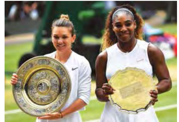
Simona Halep (Romania) beat Serena Williams (USA) to win the Ladies' Singles in 2019.