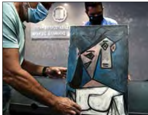
Athens, Greece ▲ A recovered painting by Picasso is displayed by police nearly a decade after it was stolen from the country's biggest state art gallery in Athens.