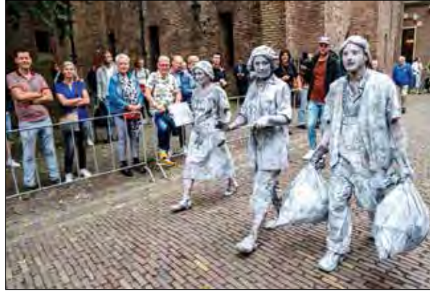
The Hague, the Netherlands Living statues take part in a demonstration by the CNV trade union, demanding better pay and appreciation for public sector workers.