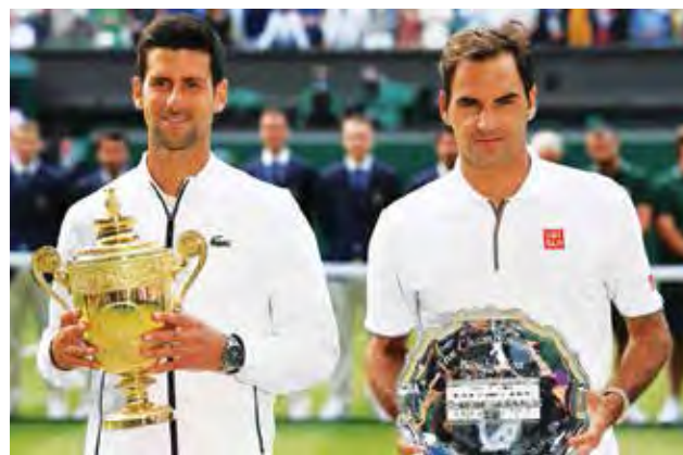
Novak Djokovic (Serbia) beat Roger Federer (Switzerland) to win the Gentlemen's Singles in 2019.

Record plaque about the longest match ever played at Wimbledon.