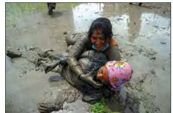
Kathmandu, Nepal ▲ Women play in a muddy paddy-field during 'National Paddy Day', which marks the start of the annual rice planting season, in Tokha village on the outskirts of Kathmandu.