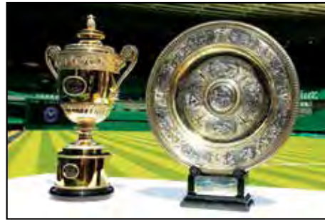
The Gentlemen's and Ladies' Singles trophies