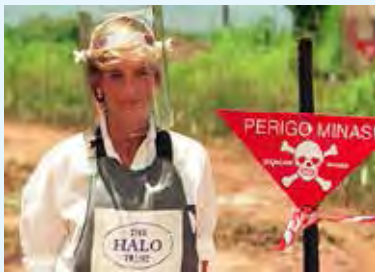
Princess Diana walked through an active minefield in Angola ▲

Diana remained the object of worldwide media scrutiny during and after her marriage, which ended in divorce on August 28, 1996.