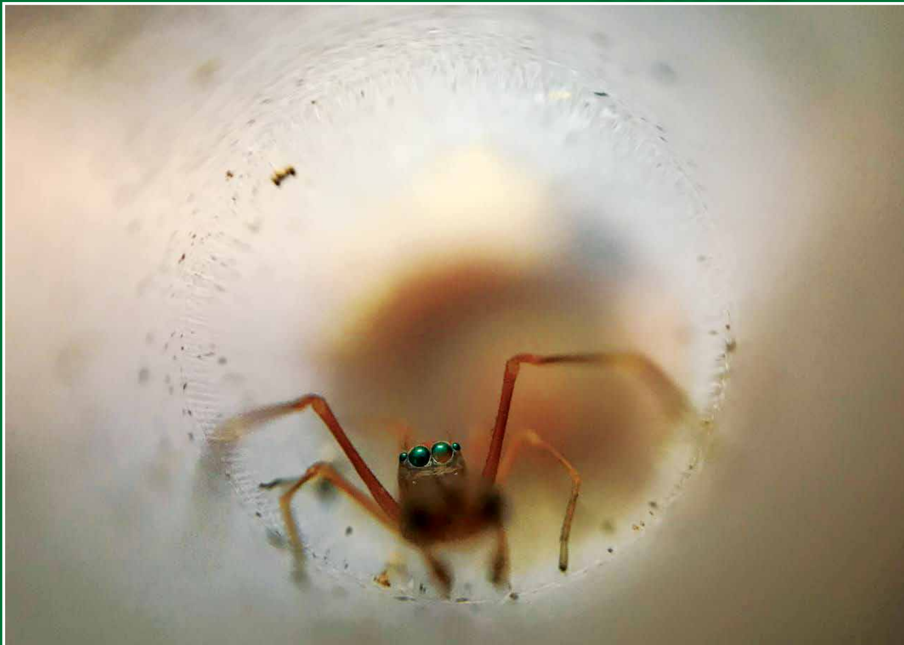
A winning capture! (WNPS Wild Kids - Backyard Wildlife Photography)