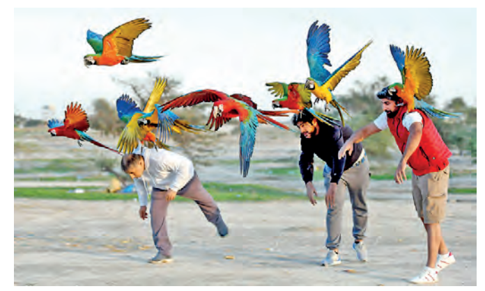
Jahra, Kuwait Participants in a regional parrot training show.