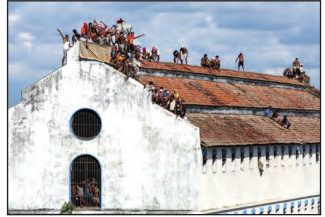
Colombo, Sri Lanka A group of prisoners protest atop the roof of the Welikada remand prison demanding they be granted bail due to Covid-19 positive cases within prisons.