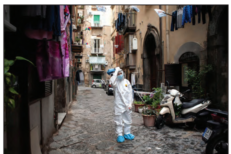
Naples, Italy A healthcare worker wearing a protective suit walks through the Spanish Quarter of the city to screen people for coronavirus.