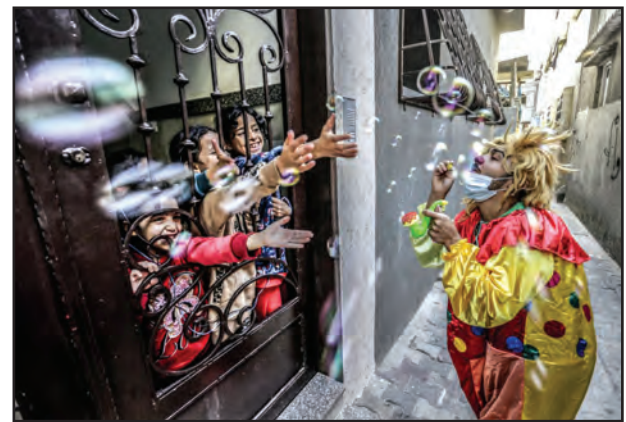
Gaza Strip A clown entertains children at their home during a lockdown after the outbreak of the coronavirus in the Jabalia refugee camp.