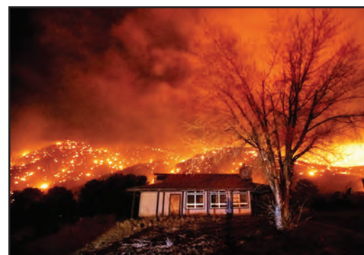
Mono County, California Embers burn along hillsides as the Mountain View Fire tears through the Walker community.