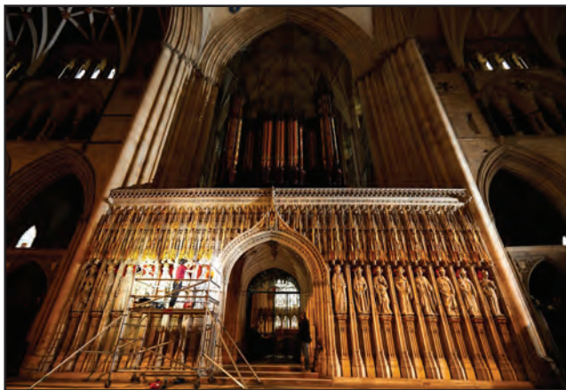
York, England The two-year-long restoration of the grand organ, containing 5,000 pipes ranging from the size of a pencil to 10 m long, enters its final phase at York Minster.