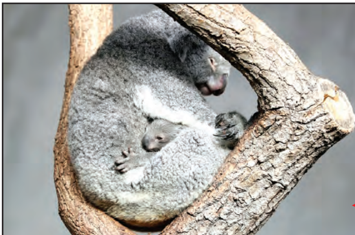
Zurich, Switzerland A koala joey looks out of the pouch of its mother Pippa at the zoo in Zurich.