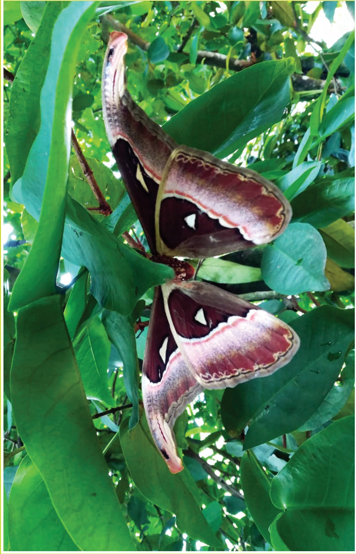
An Atlas Moth, one of the largest insects on the planet, seen in a home-garden in Padukka