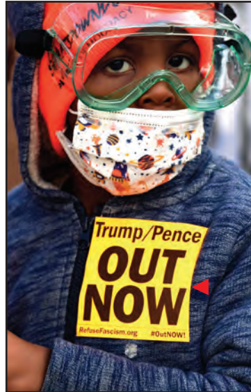
Washington DC, USA A young boy joins community members as they replace protest art on the fence surrounding the White House at Black Lives Matter Plaza, after supporters of President Trump tore it down.