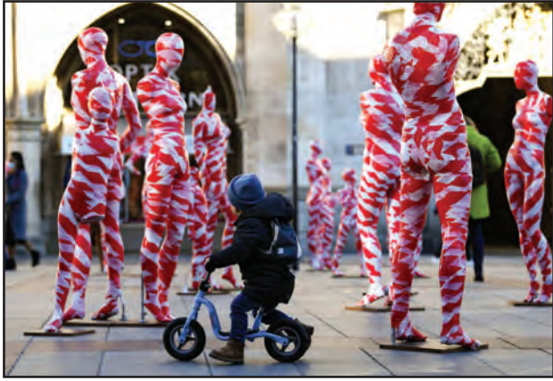
Munich, Germany An art installation of 111 mannequins appears on Marienplatz, calling for more mindfulness and appreciation in times of coronavirus.