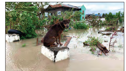
Pola, Philippines A dog sits on a submerged concrete post after Typhoon Molave hit the town.