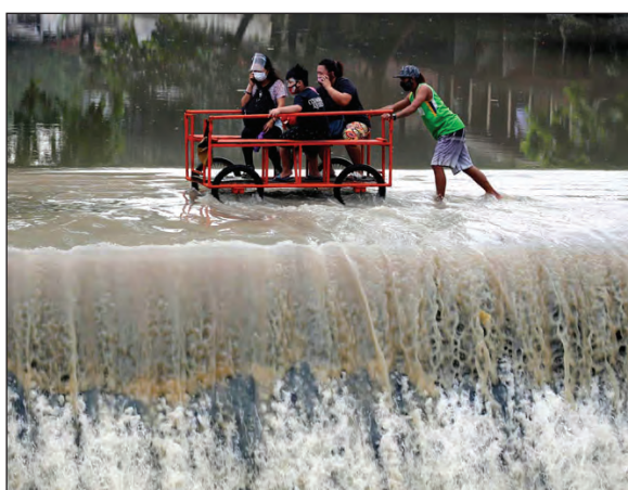
Las Pinas, Philippines Villagers manoeuvre a rickshaw through a flood.