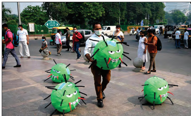
New Delhi, India An officer from the district magistrates' office holds a Covid-19 mascot in a market area during an awareness campaign against coronavirus and rising air pollution.