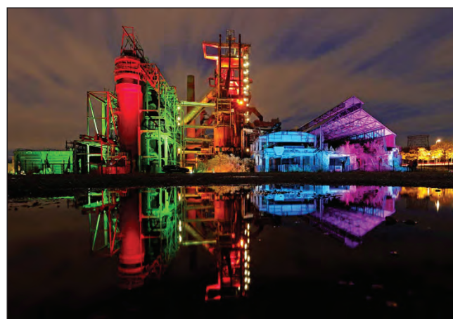
Dortmund, Germany The former Phoenix West blast furnace is illuminated by the artist Thorsten Pfister.