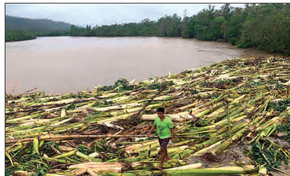
Pola, Oriental Mindoro province, Philippines A resident walks past uprooted banana trees washed up on a river bank after Typhoon Molave.