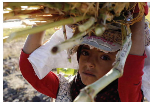
Amran province, Yemen A girl carries sorghum during the harvest season.