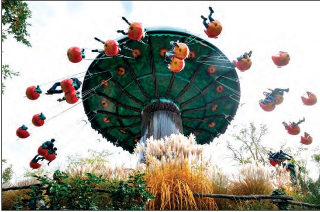
Burgenland, Austria Visitors aboard the Apple ride at the Family Neusiedler amusement park near Sankt Margarethen.