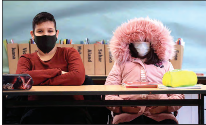
Bonn, Germany A schoolgirl wears a winter coat against the cold as school resumes with open windows and face masks to protect against the spread of Covid-19.