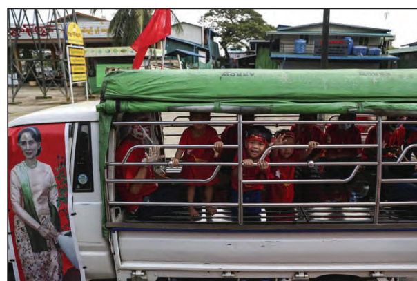
Yangon, Myanmar Children cheer in a truck carrying an image of Aung San Suu Kyi during an election rally for the National League for Democracy.