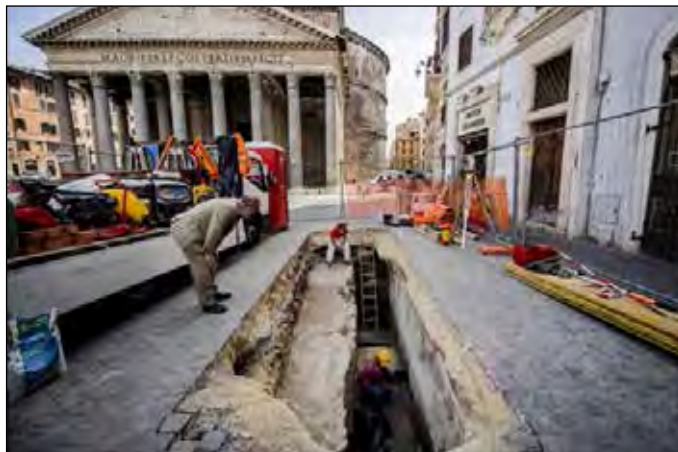
Rome, Italy Ancient imperial flooring is found during archaeological investigations near the Pantheon.