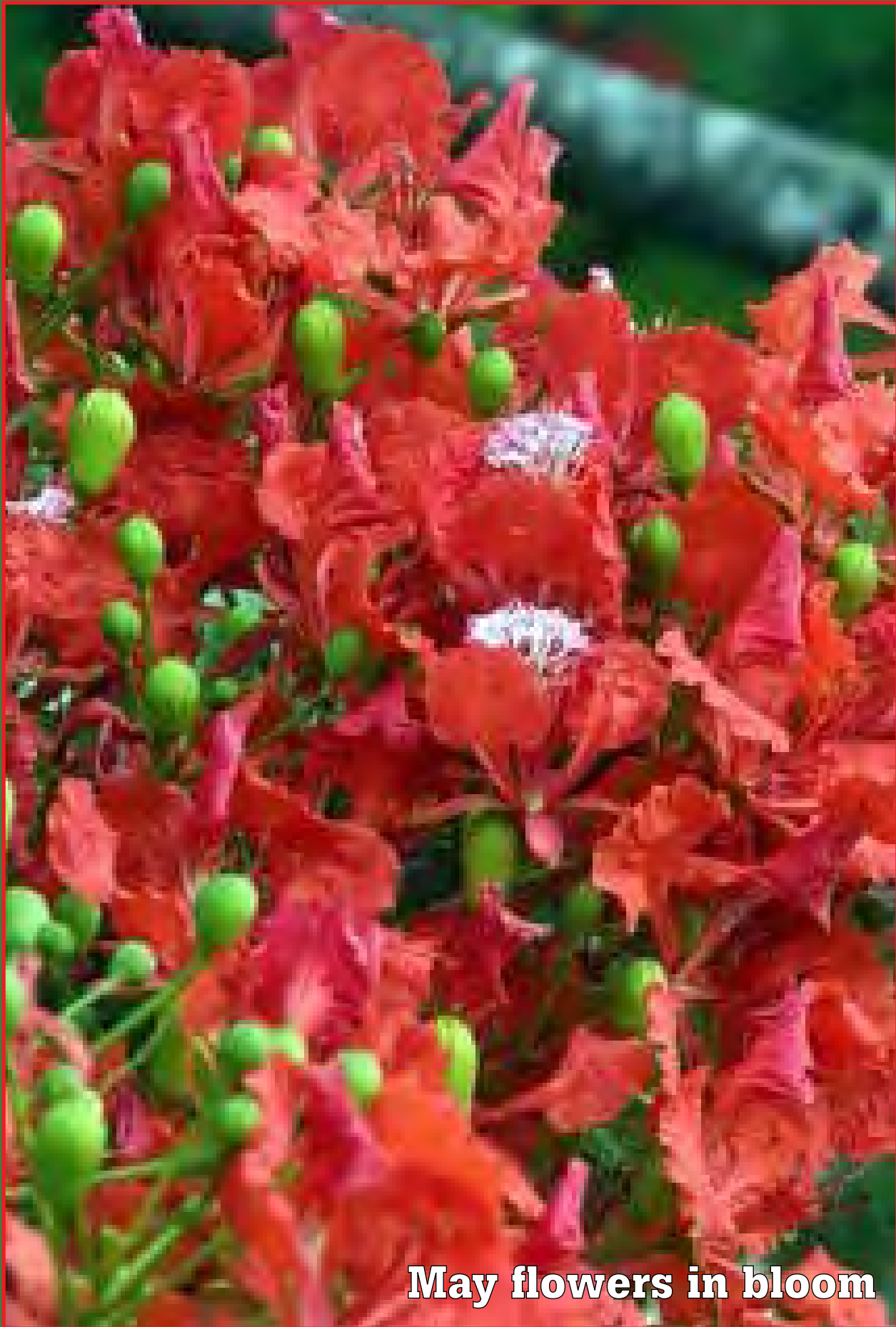
May flowers in bloom