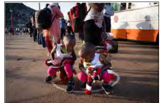
Kigali, Rwanda Children stay in a white circle to adhere to physical distancing measures as they wait for a bus at Nyabugogo station.