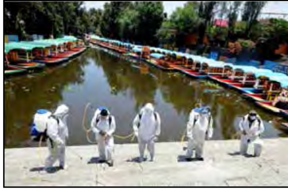
Mexico City, Mexico Workers disinfect the Trajineras Xochimilco, a tourist attraction where visitors can ride a gondola through the canals.