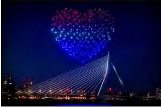
Rotterdam, Netherlands Three hundred luminous drones above the river Maas at Erasmus Bridge are displayed as a tribute to freedom and health.