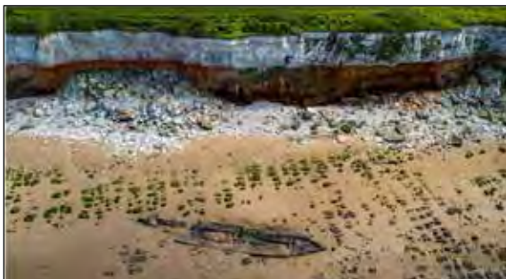
Hunstanton, England The wreck of the Sheraton appears at low tide. Between 1915 and 1918 the trawler was used during boom defence work and in the Second World War it served as a patrol vessel. In 1945, it became a target ship, before being wrecked in 1947. In 2004, the wreck was 38.5 m long by 5.35 m wide, with a substantial section of the metal hull surviving.