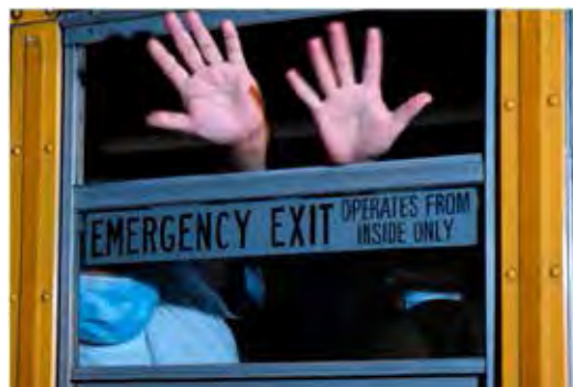
Guatemala City, Guatemala Migrants, part of a group of 76 deported from the United States, wave from a bus upon landing at the city's air force base.