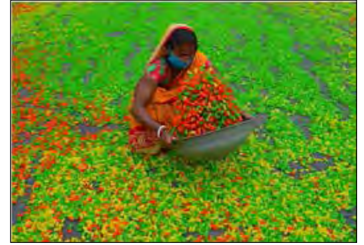
Agartala, India Workers dry pipe papad made from seasoned, coloured dough.