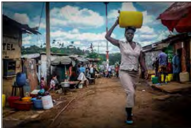
Nairobi, Kenya A woman carries a can of water back home during a water shortage amid the ongoing coronavirus curfew.