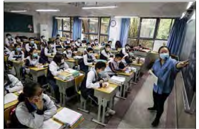
Wuhan, China High school students back in the classroom for the first time since their city, the ground zero of the coronavirus pandemic, shut down in January.