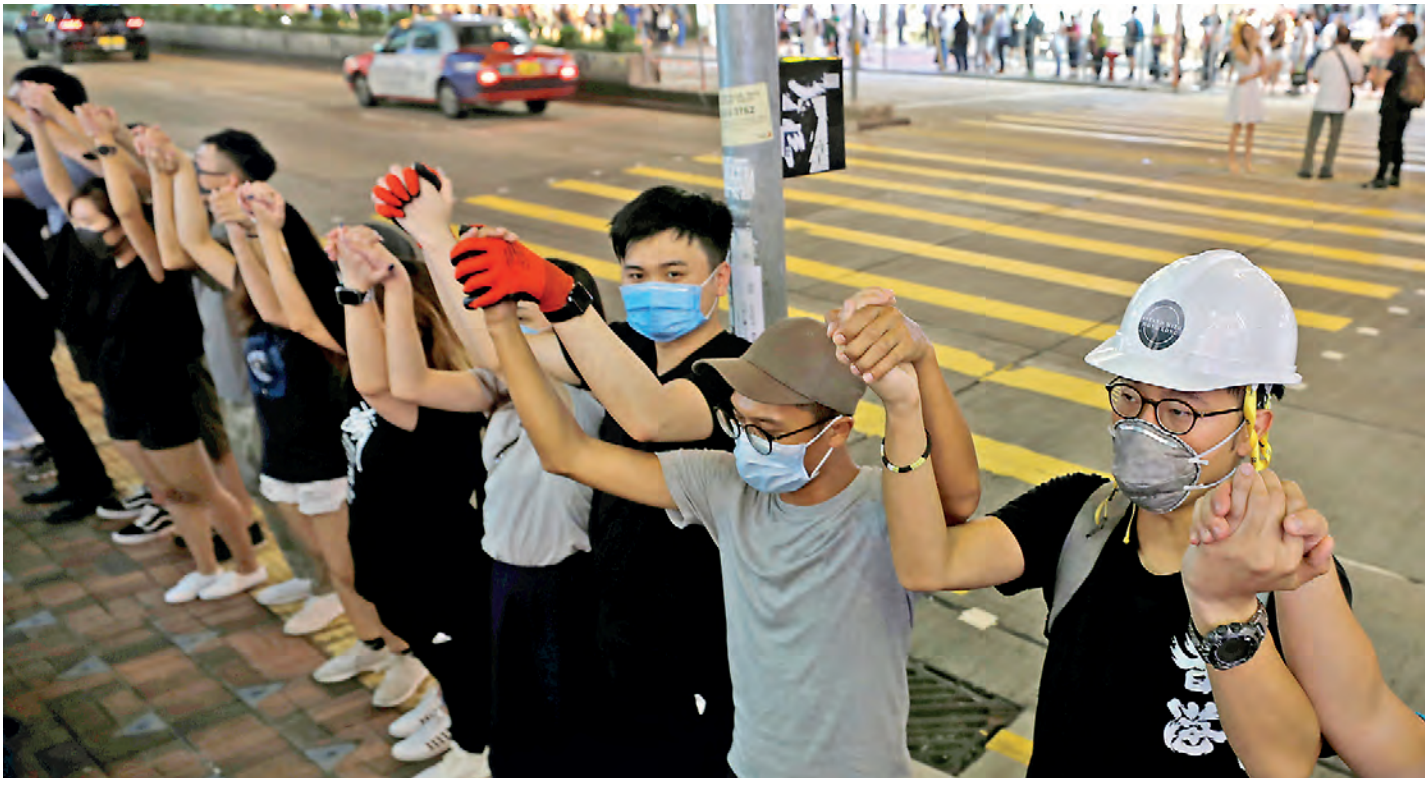
Anti-extradition bill protesters hold hands to form a human chain during a rally to call for political reforms at Mongkok, in Hong Kong on Friday.

Named after the Prophet Mohammed, the marble-decorated mosque has capacity for more than 30 000 people and has been described by the Chechen authorities as the "largest and most beautiful" mosque in Europe.