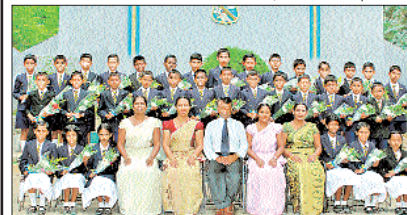
Students who got through the Grade 5 Scholarship Examination 2011