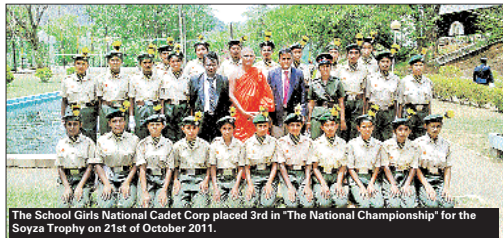
The School Girls National Cadet Corp placed 3rd in 'The National Championship' for the Soya Trophy on 21st of October 2011.