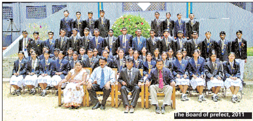
The Board of prefect, 2011

At present, the student population is over 2300, the academic staff exceeds 110 and non academic staff about 20. Their commit-