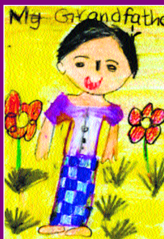
Supuni Bhagya (7 years) Galle