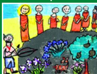
Supuni Bhagya Siridhamma College