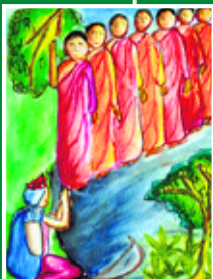
Shadana Binushi Carmel Ballka Central College, Chilaw