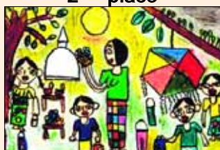
Savindu Herat Royal International School, Kurunegala