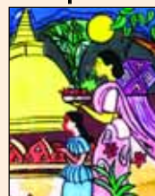
Nimha Pathirage Musaesus College

Please note that we have adjusted the age groups for the competition as there is some overlapping of ages. The age groups will now be as follows: 4 – 6 years, 7 – 10 years and 11 – 14 years