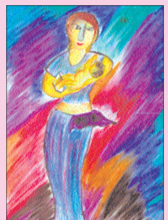
Shenya Thelge (13 years) Methodist College