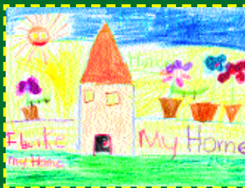
Himani Molligoda (5 years)