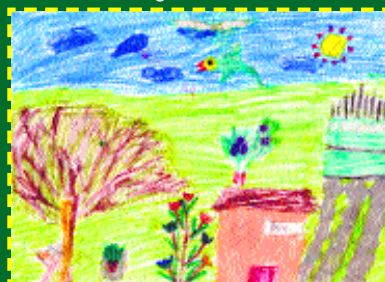
Nethmi Wickramaarachchi (Grade 4) Buddhist Ladies College, Mt. Lavinia